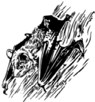
Gould's Wattled Bat